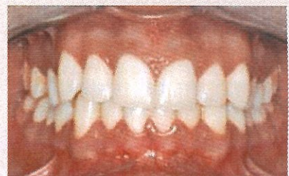
FIGURE 7 —Post treatment result.