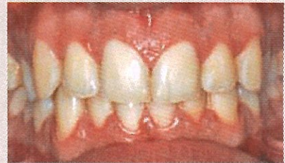
FIGURE 3 —Patient needing bleaching treatment.

With traditional methods standardization of the film impression is very difficult and researchers are continually experimenting with new measurement methods and colour scales. 7-9 Colorimeters are instruments which are speci-