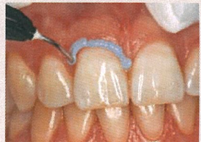
FIGURE 5 —Light curing resin dam (Gingival Barrier) was placed.