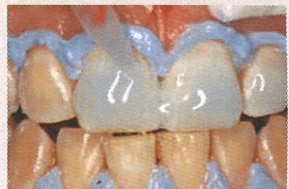
FIGURE 6 —Pola Office+ gel was directly applied on the vestibular surface of the teeth and left on according to the manufacturer's instructions.