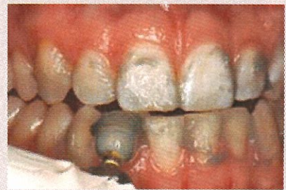
FIGURE 4 —Patient's teeth were cleaned using a paste made of pumice and water.