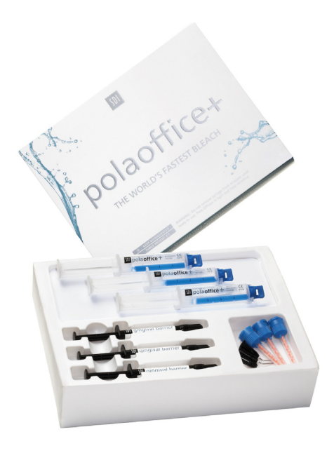
A Pola Office+ 3 Patient Kit

meaning less chair time, greater patient comfort, and higher profitability for the office. Since Pola offers the same whitening results without a light, dentists save time, cost, and effort during each treatment.