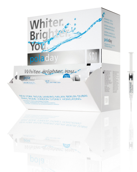
Pola Take Home Dispenser Kit (50 Individually Wrapped syringes)