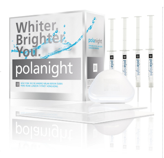
🔺 Pola Take Home 10 Syringe Kit

SDI offers a trio of at-home whitening systems to suit a variety of patients, depending on their desired results. Starting at 15 minutes once a day and virtually no sensitivity, Pola's take home